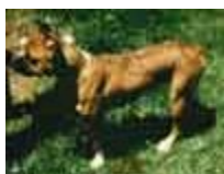
Figure 1. Ringworm caused by Microsporum canis . Individual lesions may coalesce, resulting in large, irregular lesion configurations. - To view this image in full size go to the IVIS website at www.ivis.org . -

Canine ringworm lesions often appear as circular, bald patches 1 to 4 cm in diameter. The hair is broken at the base in lesion areas, creating a shaved appearance. Pale skin scales usually occupy the center of the lesion and have a "powdery" appearance, while the edges form an erythematous ring. If individual lesions coalesce, an irregular, large lesion configuration can be observed (Fig.1).