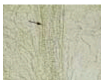
Figure 4. Sheet of arthroconidia (arrow) revealed after treatment of a skin scraping with 10% KOH. This diagnostic method for ringworm is commonly used by both mycologists and clinicians. - To view this image in full size go to the IVIS website at www.ivis.org . -

In order to visualize those structures it is necessary to clear the sample using a strong alkali solution such as KOH, NaOH or Ca(OH) 2 ; 10% KOH is the most common solution used by mycologists and clinicians (Fig.4 and Fig.5).