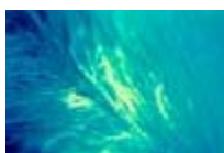
Figure 2. Fluorescent hair of a dog infected with Microsporum canis . Wood's lamp. (With permission from Veterinary Bacteriology and Mycology, School of Veterinary Medicine, University of Wisconsin, USA). - To view this image in full size go to the IVIS website at www.ivis.org . -

Wood's lamp emits UV light at a wavelength of 330 - 365 nm and is used in a dark room to examine hairs for certain dermatophytes by shining the light directly on the sample. Microsporum canis and M. equinum show a yellowish-green fluorescence due to the pteridine secreted by these fungi.