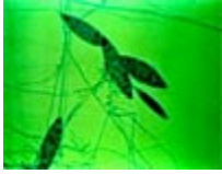
Figure 9a. M. gypseum . (With permission from Veterinary Bacteriology and Mycology, School of Veterinary Medicine, University of Wisconsin, USA). Observation of a LPCB mount will reveal septate hyphae and numerous thin-walled, elliptical macroconidia that usually contain no more than six compartments. A few smooth-walled, club-shaped microconidia may be present. - To view this image in full size go to the IVIS website at www.ivis.org . -

Trichophyton mentagrophytes - On Sabouraud dextrose agar or DTM, a colony with a powdery or cottony surface, which is usually flatter than that of M. canis , develops within 7 to 14 days (Fig. 9b and Fig. 9c). The reverse side is usually brown. On DTM, the media should change from amber to red concurrent with growth. Observation of a LPCB mount will reveal septate hyphae. Numerous round microconidia are present in clusters on the conidiophores. Spiral coils are often observed. Cigar-shaped macroconidia may be present in some cultures.