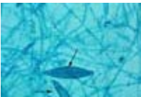
Figure 7. Microsporum canis , showing septate hyphae and numerous, fusiform, thick-walled macroconidia (arrow) that usually contain more than 6 septa. - To view this image in full size go to the IVIS website at www.ivis.org . -

Microsporum canis - A flat, white, fluffy, spreading colony develops within 7 to 14 days. A characteristic deep yellow pigment may be observed on the reverse side of a colony on Sabouraud dextrose agar or DTM. On DTM, the media should change from amber to red, concurrent with growth. Observation of a LPCB mount will reveal septate hyphae and numerous, fusiform, thick-walled macroconidia that usually contain more than six compartments. A few club-shaped, smooth-walled microconidia also may be present, as well as round-shaped clamidoconidia [26] (Fig.7 and Fig.8).