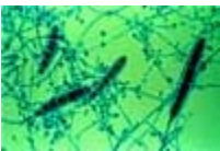
Figure 8. Macroconidia and microconidia of Microsporum canis . (With permission from Veterinary Bacteriology and Mycology, School of Veterinary Medicine, University of Wisconsin, USA). - To view this image in full size go to the IVIS website at www.ivis.org . -

Microsporum gypseum - A flat, cinnamon to buff-colored colony with a powdery surface develops within 7 to 14 days on Sabouraud dextrose agar or DTM. On DTM, the media should change from amber to red concurrent with growth. Observation of a LPCB mount will reveal septate hyphae and numerous thin-walled, elliptical macroconidia that usually contain no more than six compartments. A few smooth-walled, club-shaped microconidia may be present (Fig. 9a).