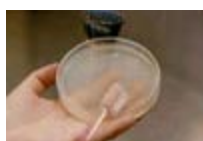
Figure 3. Mackenzie's technique consists of brushing an animal's fur with a disinfected dental brush, followed by culture in an appropriate medium. - To view this image in full size go to the IVIS website at www.ivis.org . -

Alternatively Mackenzie's technique [26] may be used (Fig. 3). It consists of brushing the fur of an animal with a disinfected dental brush and is probably the best option if required to sample large numbers of infected animals or where it is difficult to restrain them, e.g., adult cats.