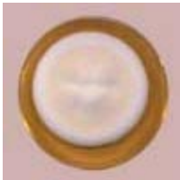
Figure 9c. Trichophyton Mentagrophytes - "Downy" surface on phytone yeast extract (PYE) agar. - To view this image in full size go to the IVIS website at www.ivis.org . -