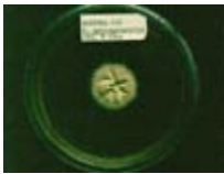
Figure 9b. Trichophyton mentagrophytes colony with a powdery or cottony surface on Sabouraud dextrose agar. - To view this image in full size go to the IVIS website at www.ivis.org . -

Trichophyton mentagrophytes - On Sabouraud dextrose agar or DTM, a colony with a powdery or cottony surface, which is usually flatter than that of M. canis , develops within 7 to 14 days (Fig. 9b and Fig. 9c). The reverse side is usually brown. On DTM, the media should change from amber to red concurrent with growth. Observation of a LPCB mount will reveal septate hyphae. Numerous round microconidia are present in clusters on the conidiophores. Spiral coils are often observed. Cigar-shaped macroconidia may be present in some cultures.