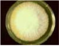
Figure 6. M. canis culture. Growth of dermatophytes (Microsporum and Trichophyton) is optimal at 25 - 28°C, with luxuriant growth in about 4 to 7 days. - To view this image in full size go to the IVIS website at www.ivis.org . -