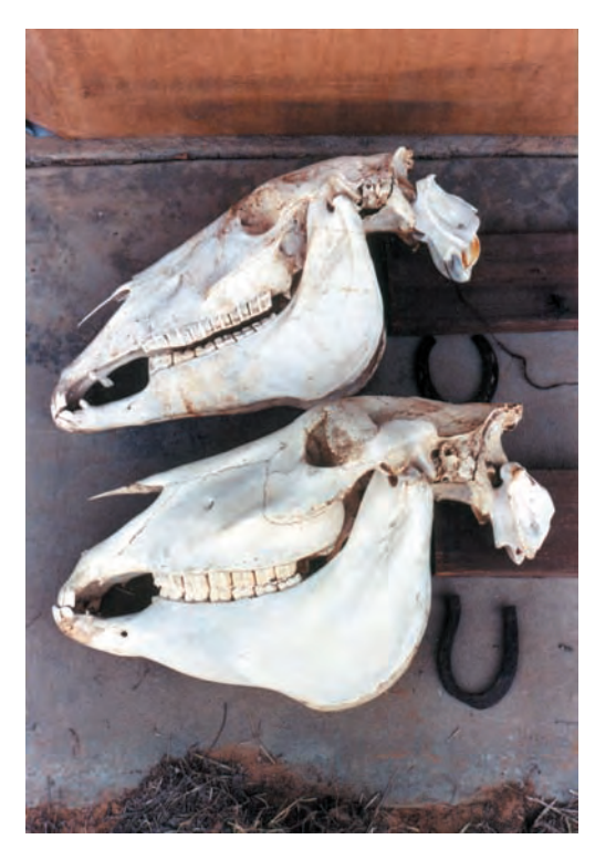
Fig. 4. Both the horse (top) and the donkey (bottom) weighed approximately 450~\rm kg in life. The donkey was a mammoth breed of donkey.

status of the other sizes, yet this size is the work donkey in many countries of the world.