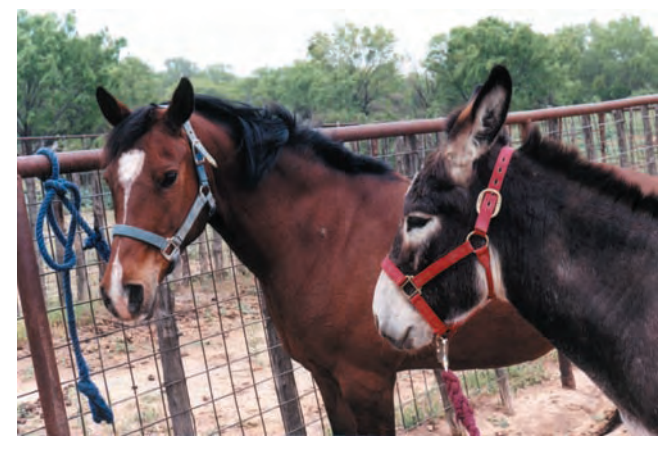
Fig. 2. Donkeys are not just horses with long ears.

In 1785, George Washington investigated the purchase of a good jack from Spain but was told that the exportation of jacks was illegal in Spain. However, when the king of Spain learned that George Washington wanted a good jack to produce work mules in America, he sent a jack and a jennet as a gift. The jack was named "Royal Gift" and stood at Mt. Vernon. "Royal gift" was between 14.2 and 15 H tall and commanded a stud fee that was higher than the