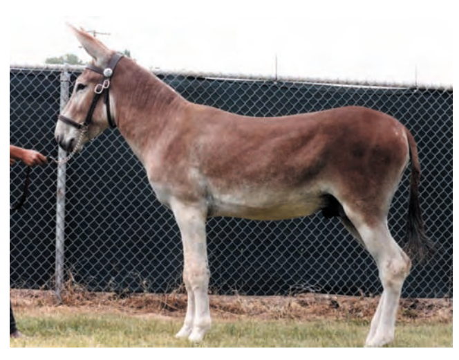
Fig. 7. Notice the shape of the neck of this large jack donkey. The jugular furrow is obscured by the cutaneous colli muscle.

According to the classic anatomy textbook, the horse has a thin myo-fascial layer, called the cutaneus colli muscle, that is peeled away during the dissection process to reveal the jugular furrow. The cu-