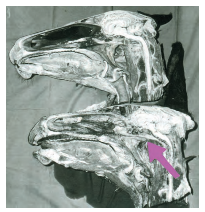
Fig. 5. Arrow indicates the caudal margin of the laryngeal diverticulum of the donkey in this cross-sectioned head. Compare with the horse above.

functional anatomy and the patho-physiology of the respiratory tract of the donkey were the primary goals.