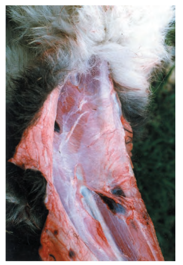
Fig. 8. Two-week-old miniature donkey foal. Even in the immature donkey, the cutaneous colli muscle obscured part of the jugular furrow and the jugular vein. The bruise (center) is the result of a failed attempt at venapuncture.

taneus colli muscle of the horse is a relatively small V-shaped muscle developed in the superficial fascia on the caudoventral region of the neck. It arises from the manubrium sterni and a median fibrous raphe. The fibers diverge dorso-cranially from this raphe to the sides of the neck, thinning out and blending into the superficial cervical fascia.<sup>5</sup>