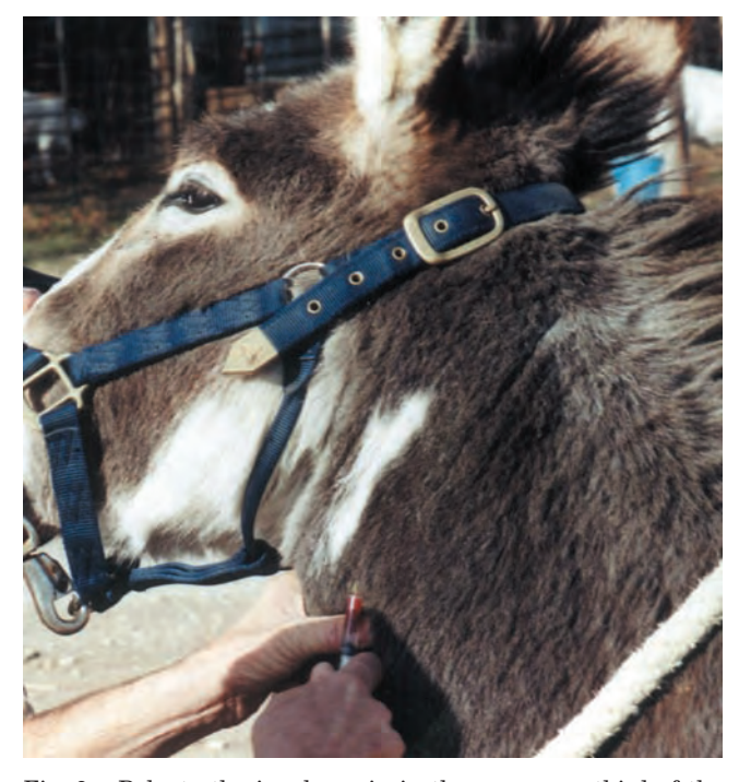
Fig. 9. Palpate the jugular vein in the upper one-third of the jugular furrow.

The shape of the donkey sacrum and the spacing and direction of the spines of the sacrum and coccygeal