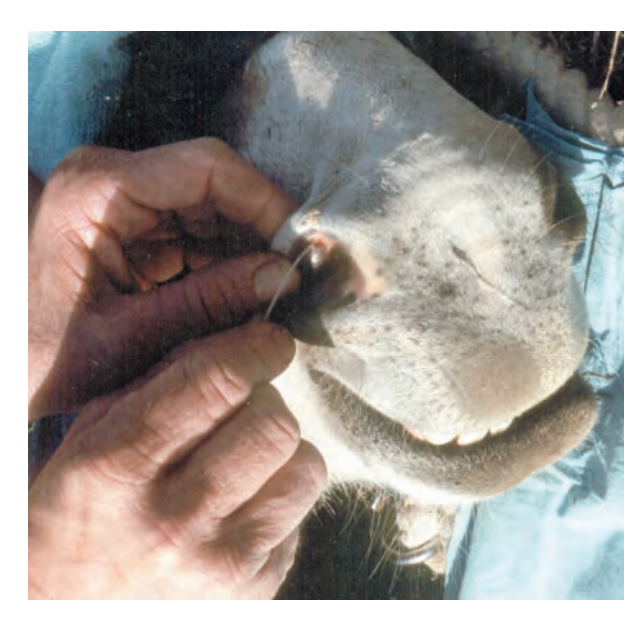
Fig. 10. The aperture of the nasolacrimal duct of the donkey is located on the flare of the nostril rather than on the floor of the nostril as it is in the horse.

vertebrae differ in the donkey. Also, the location of the end of the spinal cord and the end of the dura differs from those of the horse. Injection of a local anesthetic into the epidural region necessitates knowledge of these differences. Indications for caudal epidural anesthesia in the horse include surgical procedures involving the tail, perineum, anus, rectum, vulva, and vagina (as for Caslick's suture, rectovaginal tear repair, prolapsed rectum, or tail amputation), and symptomatic relief of pain during