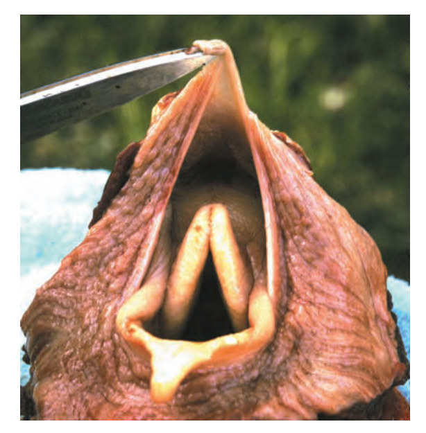
Fig. 6. This fresh specimen of the donkey pharynx shows how the donkey's laryngeal diverticulum could easily entrap a nasogastric tube.

One additional difference is that the donkey typically has a narrower ventral meatus than a horse or