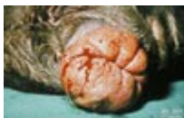
Figure 10. A vaginal fold prolapse involving the entire circumference; the prolapse has a doughnut shape. - To view this image in full size go to the IVIS website at www.ivis.org . -

If the lateral sides or the entire circumference of the vaginal mucosa are involved, the prolapse will have a doughnut shape (Fig. 10). The edematous vaginal tissue is tied off in portions by bringing a needle with two strands of suture material from the center to the outside of the doughnut. Then, one of the loose ends of the suture strands in the center is inserted in a needle along with a new strand and again brought to the outside. This procedure is then repeated until the entire circumference has been covered (Fig. 11).