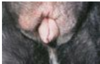
Figure 9. The remnant stump is replaced in the vagina and the urethral catheter is removed. - To view this image in full size go to the IVIS website at www.ivis.org . -