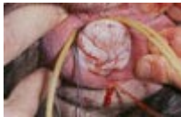
Figure 8. The edematous mucosa has been amputated. The excess suture material and elastic band will be cut. - To view this image in full size go to the IVIS website at www.ivis.org . -

It is necessary to perform this whole procedure carefully because of the risk of perioperative hemorrhage. The excess suture material and elastic band are cut and the redundant edematous mucosa is amputated (Fig. 8). The remnant stump is replaced in the vagina (Fig. 9). The urethral catheter is removed and the animal is discharged with a plastic collar so that it cannot reach the sutures. The stump distal to the elastic band becomes necrotic and in general the sutures and elastic band will be expelled within a week. To ascertain that this has happened and that there is no foreign material left in the vagina, the bitch should be re-examined a week later.