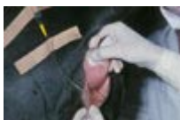
Figure 4. A catheter is inserted into the urethra of a Mastino Napolitano. The urethra is easily seen by lifting the fold prolapse. - To view this image in full size go to the IVIS website at www.ivis.org . -

It is important to keep the anatomy in mind during the entire surgery to prevent damage to the urethra! A large needle threaded with two strands of heavy suture material is inserted and transversed about 1.5 cm distal to the urethral orifice through the base of the fold prolapse (Fig. 5). Individual sutures are tied on both sides of the base of the prolapse (Fig. 6).