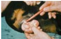
Figure 3. The edematous mucosa of a vaginal fold prolapse in a Doberman, is exteriorized as much as possible. The pen indicates the mucosal fold, which is always present in a pear-shaped vaginal fold prolapse. - To view this image in full size go to the IVIS website at www.ivis.org . -

The procedure is performed in the non-anaesthetized dog, in general in the standing position, but sometimes positioned in lateral recumbency. Sedation is only used if the bitch is very nervous. The edematous mucosa is exteriorized as much as possible (Fig. 3). A catheter is inserted into the urethra, which is easily seen by lifting the fold prolapse (Fig. 4).