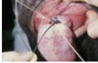
Figure 7a. Both sutures are brought around the whole prolapse and are securely tied again. An elastic band (Penrose drain) is then placed in the groove created by the sutures and tightened. - To view this image in full size go to the IVIS website at www.ivis.org . -

Both sutures are brought around the whole prolapse and are securely tied again. An elastic band (Penrose drain) is then placed in the groove created by the sutures and tightened. The elastic band is anchored with suture material to prevent slippage (Fig. 7a and Fig. 7b).