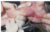
Figure 5. A large needle threaded with two strands of heavy suture material is inserted and transversed about 1.5 cm distal to the urethral orifice through the base of the fold prolapse. - To view this image in full size go to the IVIS website at www.ivis.org . -

It is important to keep the anatomy in mind during the entire surgery to prevent damage to the urethra! A large needle threaded with two strands of heavy suture material is inserted and transversed about 1.5 cm distal to the urethral orifice through the base of the fold prolapse (Fig. 5). Individual sutures are tied on both sides of the base of the prolapse (Fig. 6).