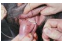
Figure 6. Individual sutures are tied on both sides of the base of the prolapse. - To view this image in full size go to the IVIS website at www.ivis.org . -