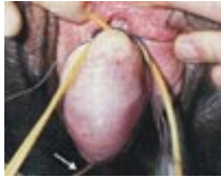
Figure 7b. A second elastic band is then placed, anchored with suture material to prevent slippage. Arrow indicates catheter (b). - To view this image in full size go to the IVIS website at www.ivis.org . -

It is necessary to perform this whole procedure carefully because of the risk of perioperative hemorrhage. The excess suture material and elastic band are cut and the redundant edematous mucosa is amputated (Fig. 8). The remnant stump is replaced in the vagina (Fig. 9). The urethral catheter is removed and the animal is discharged with a plastic collar so that it cannot reach the sutures. The stump distal to the elastic band becomes necrotic and in general the sutures and elastic band will be expelled within a week. To ascertain that this has happened and that there is no foreign material left in the vagina, the bitch should be re-examined a week later.